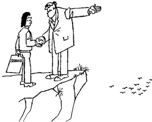
Directly: Students/ Trainees (& families)